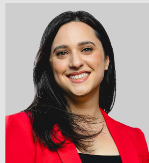
Congresswoman, Yassamin Ansari Honoree