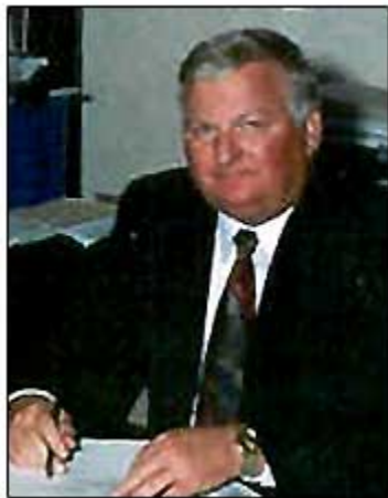
PCA Anti Graffiti Hotline Committee Chairman